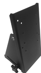
Multi attachment XAVL98201