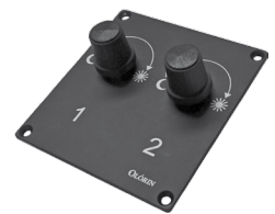
External OSD, 2 ports XAVL98502